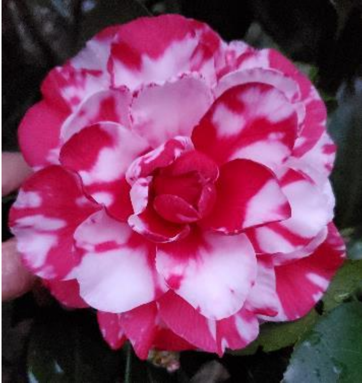
Nuccio's Bella Rosa