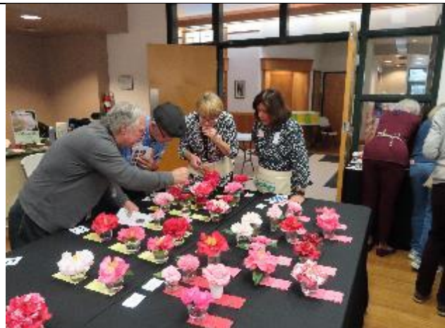
More judging of blooms