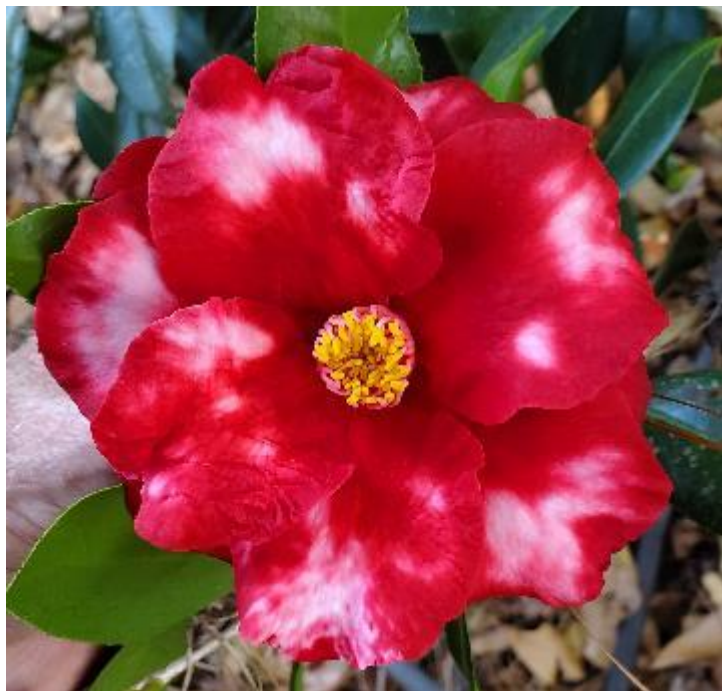
Royal Velvet Variegated

We'll setup our booth on Friday, March 17, 2023, at 3:00 PM, and GCS will have one plant to raffle at the event. We'll discuss this more at the March meeting. A sign-up sheet was passed around and nearly all time slots were filled.