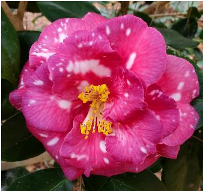
William Forrest Bray, variegated

The biggest thing on the calendar is our show in January. We have missed having two shows and it is time to get back in the groove. Hopefully Covid cases will continue to drop but it is important for everyone to remain vigilant. We were fully prepared for a show when we cancelled last January so it should not be too difficult to pull everything out of storage for the 2023 show. Plants have been purchased for our sale and maybe Charles can comment about that. It is amazing how many plants we can sell. Seems like there might be a camellia saturation point in the Gainesville area, but as of last January, based on the number of plants sold, that point had not yet been reached! Maybe Debbie Ellis can say a few words about the show.