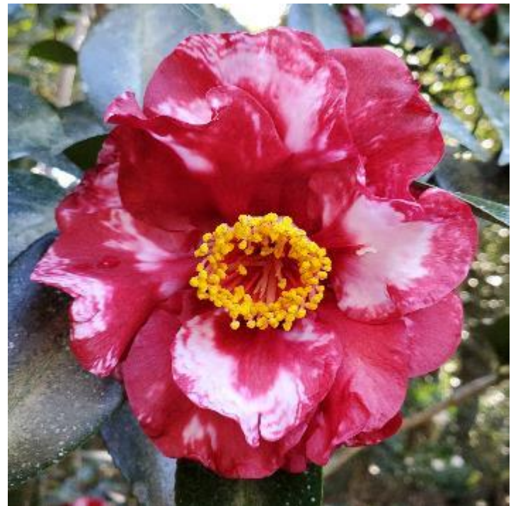
Bob Hope variegated