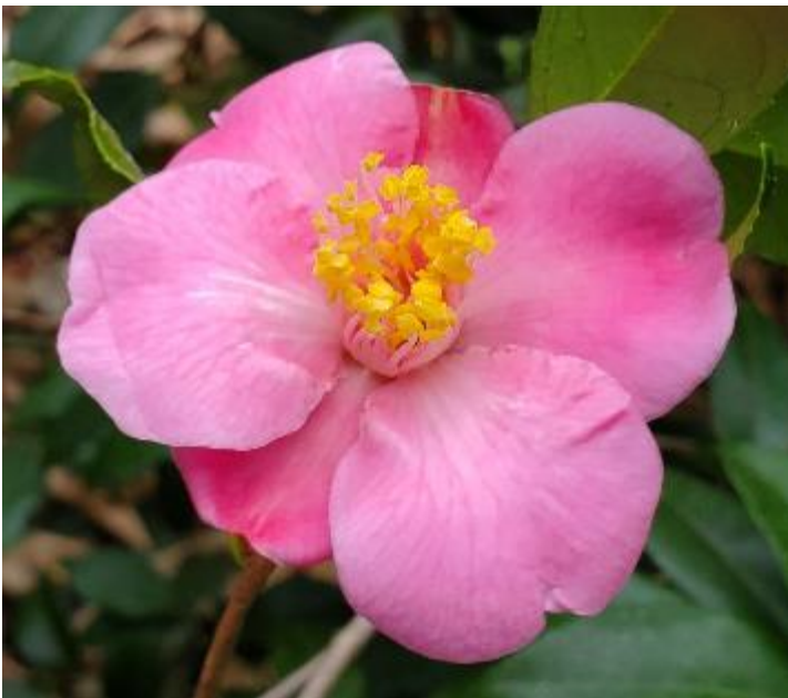
Minato No Akebono

A reminder from the President: it’s time to fertilize! Remove all dead buds and flowers. It’s okay to fertilize with live buds, but it’s better to remove them.