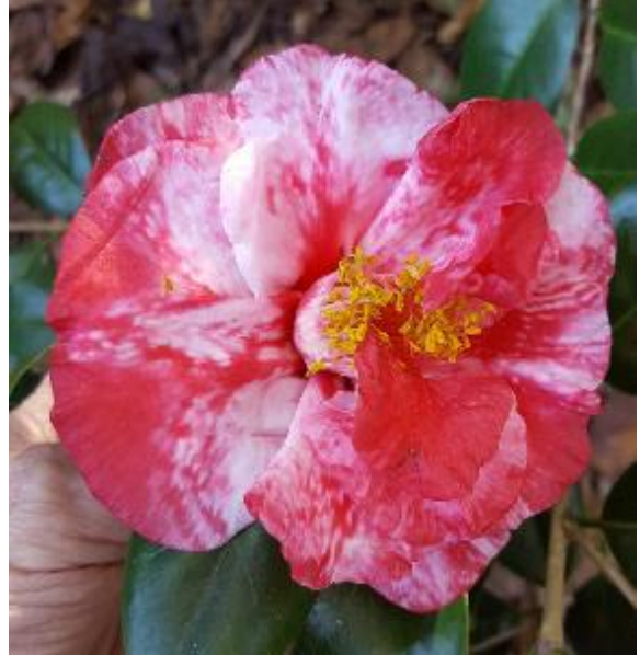
Dixie Knight Supreme