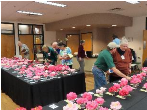
Judges and clerks working in teams