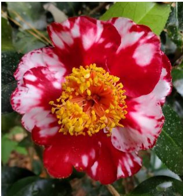
San Dimas, variegated

Mark showed examples of fragrant blooms including Cinnamon Cindy, Cinnamon Scentsation, Sweet Scentsation, and High Fragrance.