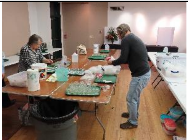
Prepping blooms for entry – note glasses of water