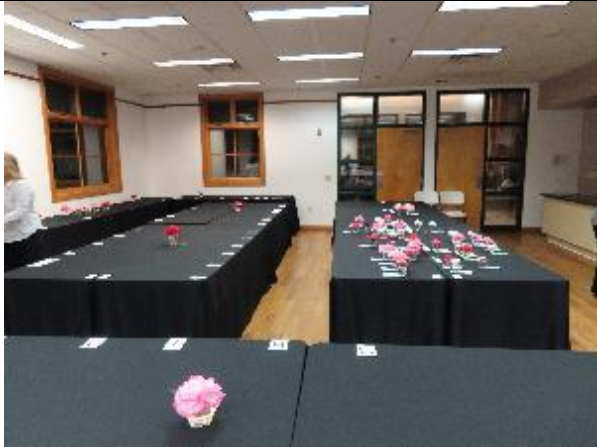
Display tables ready for blooms