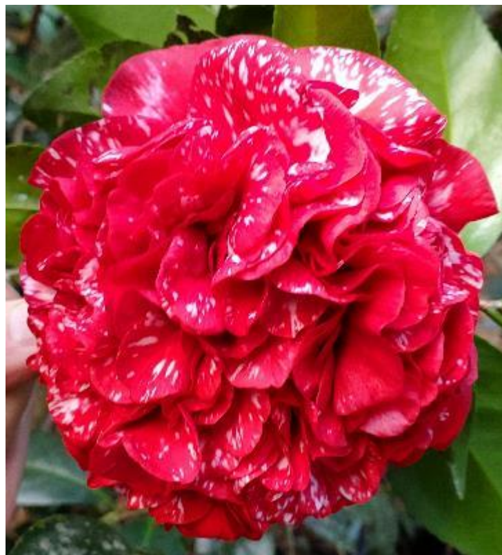
Grand Marshal variegated

Merry Reid reported our current total for both checking and savings accounts is $19,774.