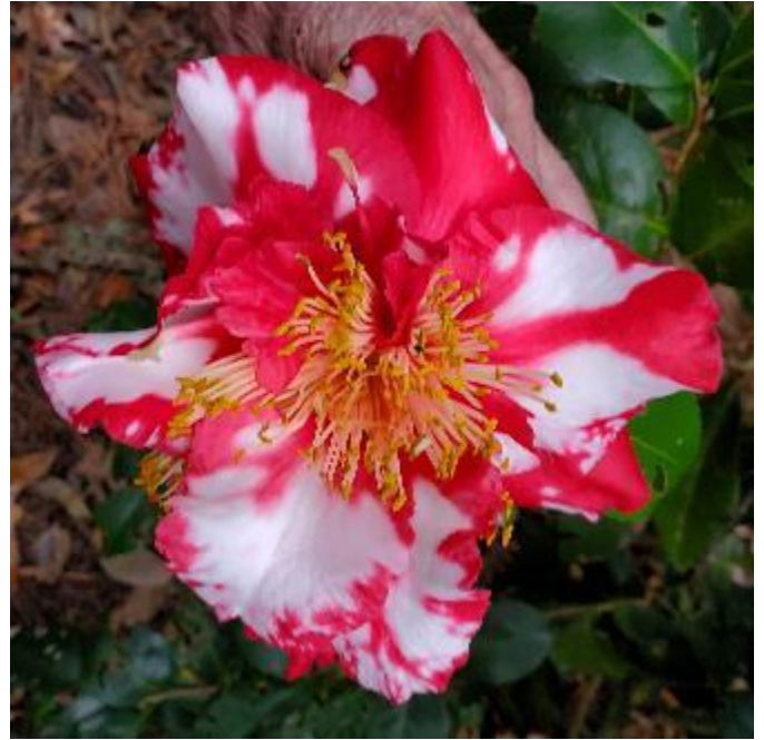
Raspberry Ripple Picotee