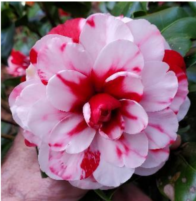
Henry Parrish variegated