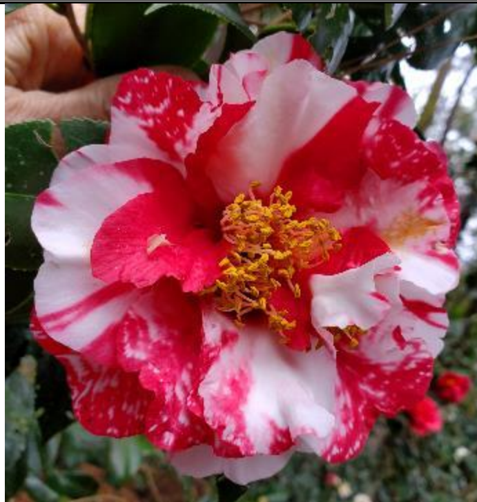
Laura Walker variegated