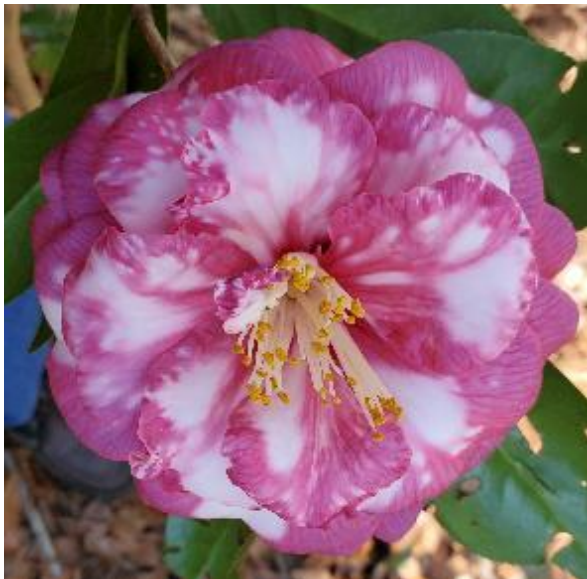
William Forrest Bray, variegated